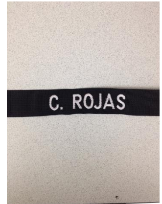
STANDARD CLOTH NAMETAG (BLACK W/SILVER LETTERING)