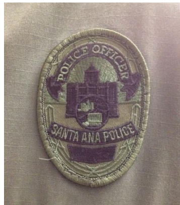
SWAT CLOTH BADGE