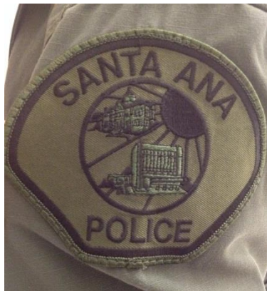
SWAT SHOULDER PATCH