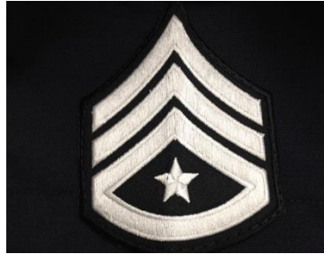
W/ROCKER & STAR