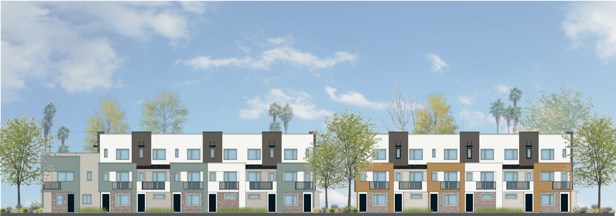
BLDG. 700 SCHEME 2