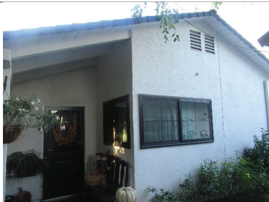
Figure 7. The rear yard contains a single-story, detached guest house (accessory dwelling unit) with a rectangular footprint and a gable roof, facing south.