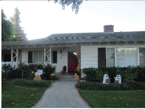
Figure 3. The building's expansive roof shelters over a detached garage, adjacent porte-cochere, and the main house, facing south.