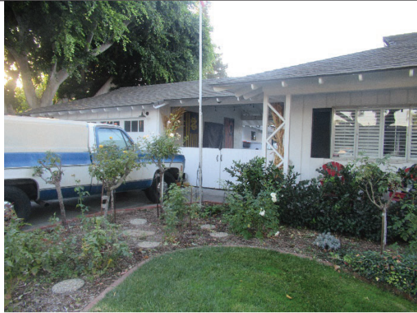
Figure 2. At the primary (north) façade the building's expansive roof shelters over a detached garage, adjacent porte-cochere, and the main house, facing south.