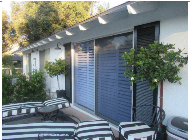
Figure 6. The rear (south) façade contains four aluminum-frame fully glazed sliding doors and one partially glazed door, facing northwest.