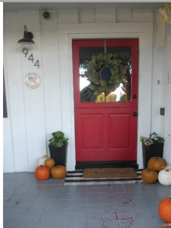
Figure 5. The front door is made of a wood Dutch door with divided lights above paired wood paneling, facing south.