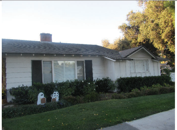
Figure 4. The building's expansive roof shelters over a detached garage, adjacent porte-cochere, and the main house, facing southwest.