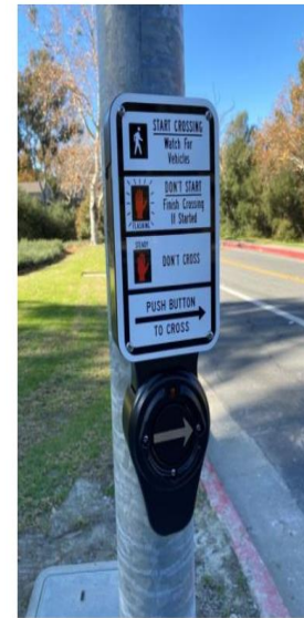
Marguerite Parkway City of Mission Viejo