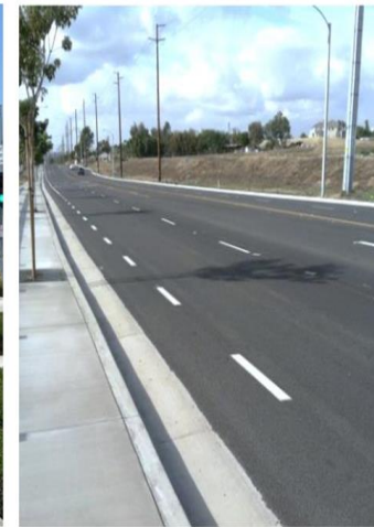
Bastanchury Road Improvements City of Yorba Linda