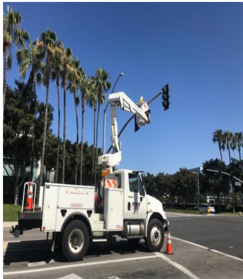
Irvine Center Drive / Edinger Avenue City of Irvine