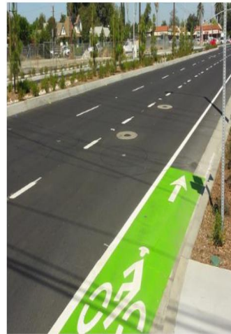
Grand Avenue Improvements City of Santa Ana