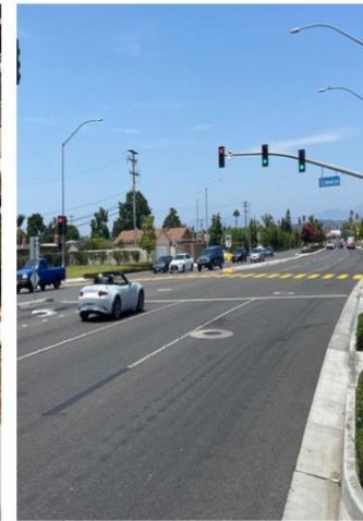
Brookhurst Street Improvements City of Anaheim