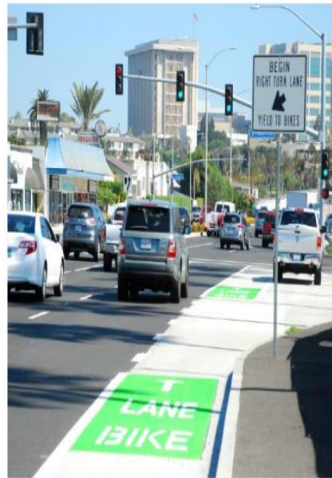
Newport Boulevard Improvements City of Newport Beach