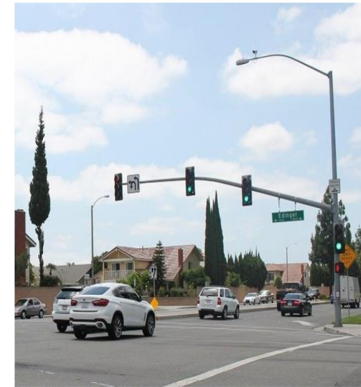
Edinger Avenue City of Fountain Valley