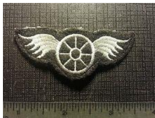
MOTOR WHEEL W/WINGS