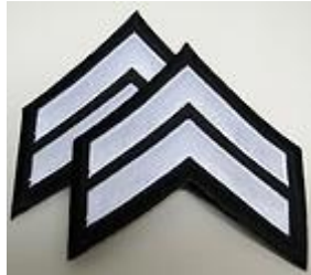
CPL. CHEVRONS (in OD Green also)