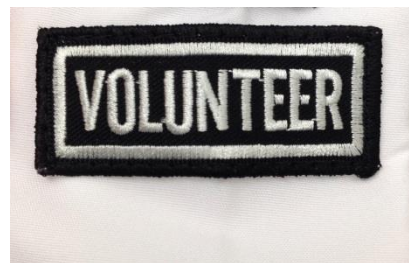
W/ROCKER SGT. VOLUNTEER ROCKERS (2 ¾