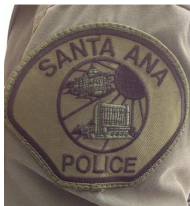
SWAT SHOULDER PATCH