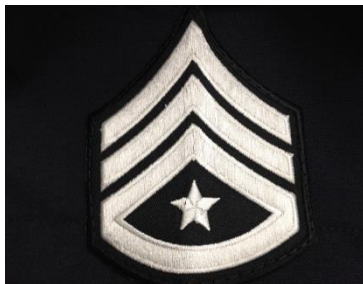
W/ROCKER & STAR