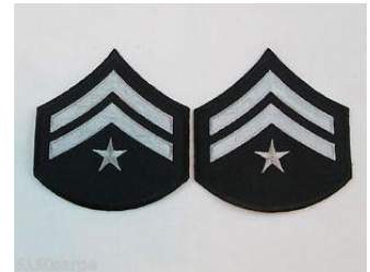
CPL. CHEVRON W/STAR