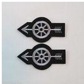
MOTOR WHEEL W/ARROW