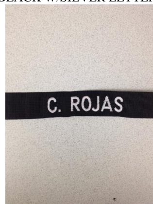
STANDARD CLOTH NAMETAG (BLACK W/SILVER LETTERING)