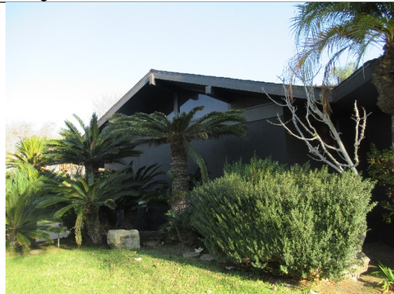
Figure 4. The prominent southwest building corner with gable roof, facing north.