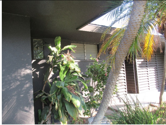
Figure 3. The building's deep overhanging eaves, facing northeast.