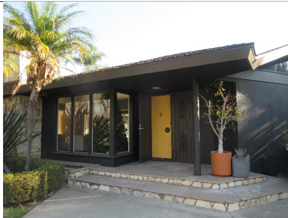
Figure 5. The main entrance is raised above two stone-clad steps and is situated under a wide overhanging eave that forms the front porch, facing northeast.