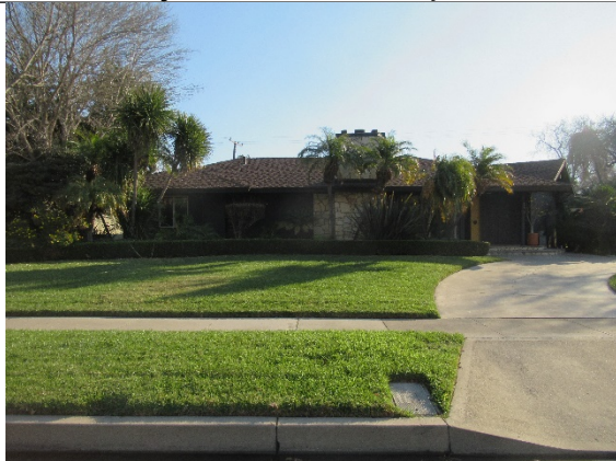
Figure 8. Primary (west) façade which contains stonewall material and wood shutters, among other features, facing east.