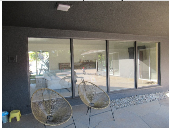
Figure 7. At the rear, large floor-to-ceiling fixed wood windows span the façade, facing west.