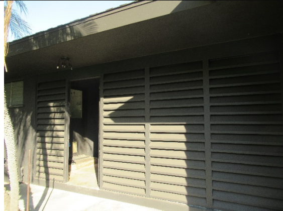
Figure 2. Louvered privacy wall along the south wing, facing north.