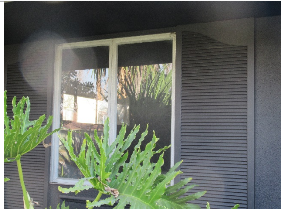
Figure 6. On the primary (west) façade, a pair of narrow casement windows, facing east.