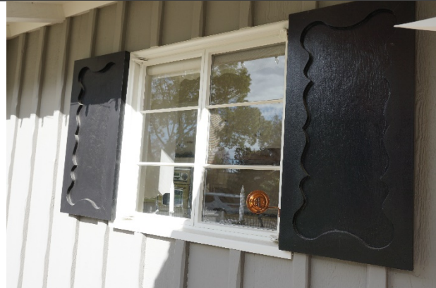
Figure 3. Distinctive board and batten siding, facing northwest.