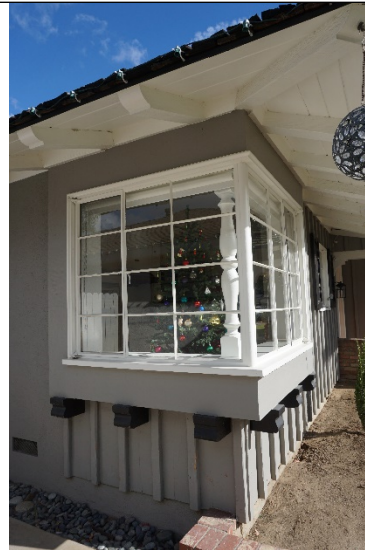
Figure 5. Corner window that projects outward from the façade and wraps around the building's southwest corner, facing northeast.