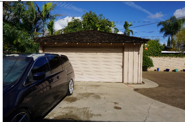
Figure 7. View of detached garage, facing north.