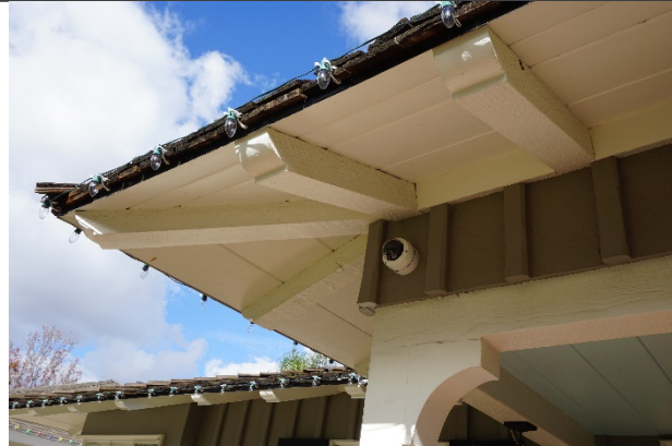
Figure 2. Exposed rafter detail, facing northwest.