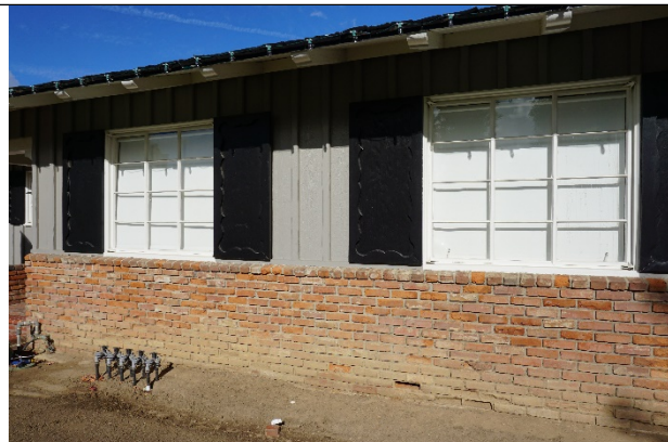
Figure 6. Two identical, steel-frame, multi-lite casement windows, facing north.