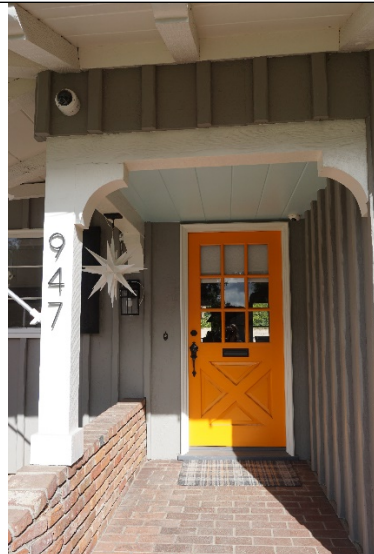
Figure 4. View of detached garage, facing north.