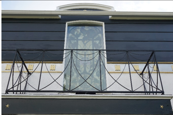
Figure 2. A single stained glass window at the second story, facing east.