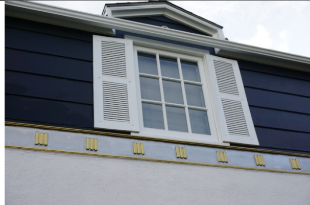
Figure 3. A two multi-lite wood-frame casement window with wood shutters, facing east.