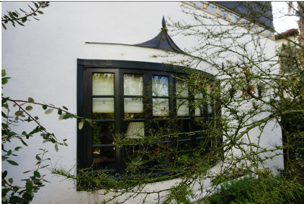
Figure 4. Multi-lite wood-frame bow window south of the entry porch, facing southeast.