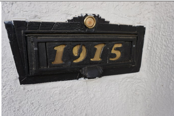
Figure 6. Original Art-Deco style address stating "1915" and mailslot resides adjacent to the main entrance, facing east.