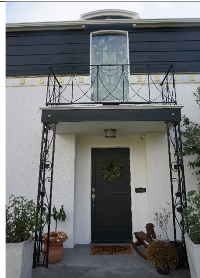
Figure 5. The entry porch, characterized by wrought iron railings, porch supports, and trim, facing east.