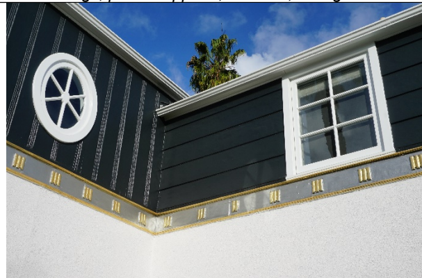
Figure 7. Single oval window at the second story with vertical siding occurring along a portion of the building's rear volume, facing northwest.