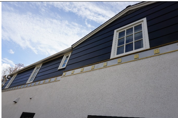
Figure 8. Stylized Classical frieze with applied triglyphs wraps around the entire building, dividing the the lower and upper stories, facing southwest.