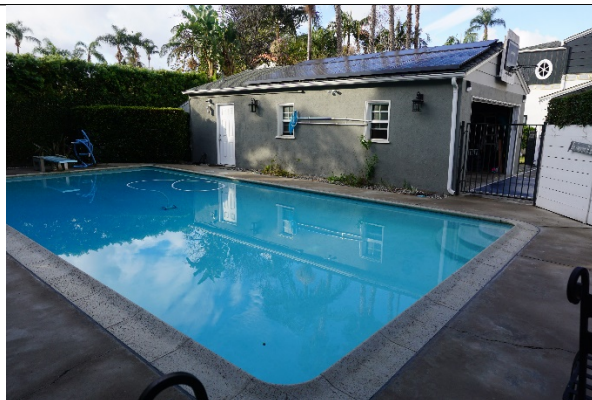
Figure 9. Detached garage and pool, facing southwest.