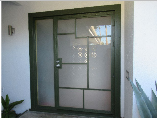
Figure 4. Wrought iron door with obscured glass and single sidelite, facing east.