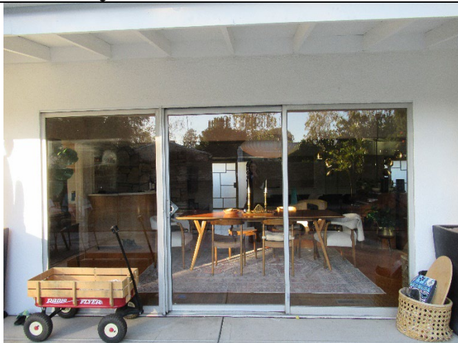
Figure 6. Aluminum-frame sliding door and a fixed window, facing west.