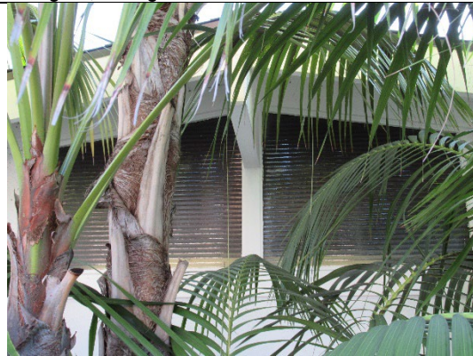
Figure 5. Two obscured-glass trapezoidal transoms, facing east.