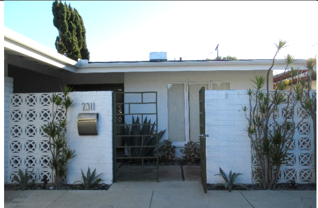
Figure 3. Concrete block brise soleil and whitewashed brick privacy wall, with geometrically patterned wrought iron gate, facing east.