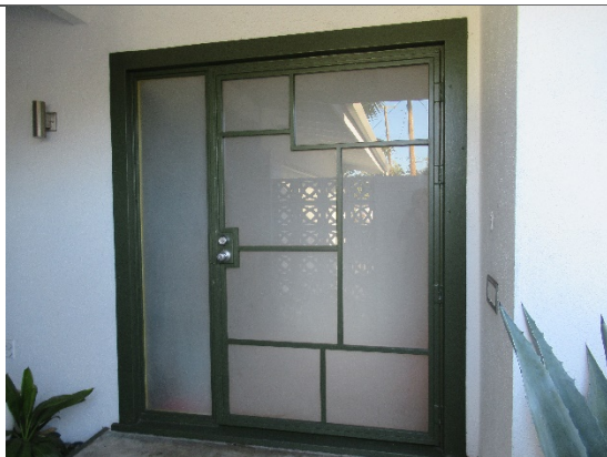
Figure 4. Wrought iron door with obscured glass and single sidelite, facing east.