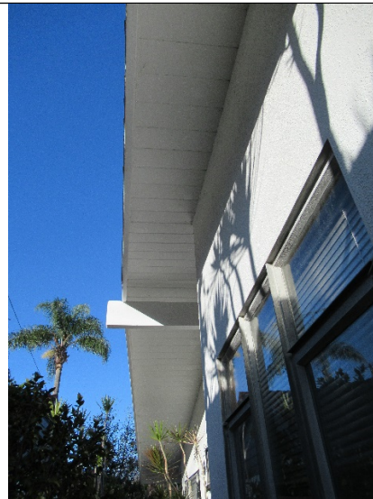
Figure 7. Long beam extending past the gable's end on the south (side) façade, facing west.