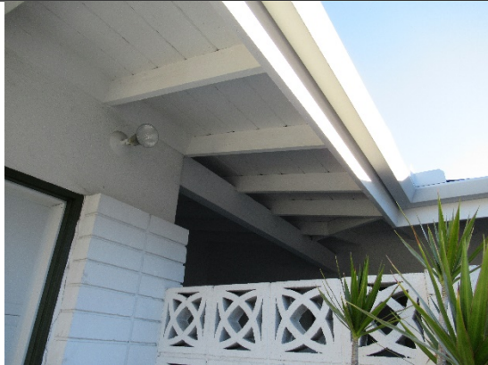
Figure 2. Exposed rafter and continuous fascia detail, facing northeast.