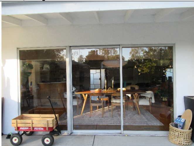
Figure 6. Aluminum-frame sliding door and a fixed window, facing west.